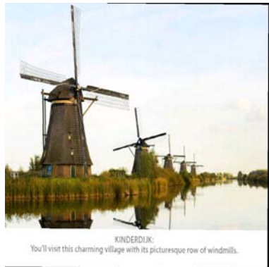
KINDERDIJK: You'll visit this charming village with its picturesque row of windmills.