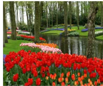
KEUKENHOF GARDENS: Explore over 70 acres of parkland with lakes, sculpture gardens, greenhouses and windmill. Millions of flower bulbs present a spectacular display of blooms every year.

Today we will have a full day of touring. The Keukenhof Gardens are on 32 hectares (70+ acres) of parkland with lakes, flower mosaics, sculpture gardens, greenhouses and a windmill to explore. We will have a boxed lunch at the gardens and then continue to the city of Delft. Delft is over 750 years old and is well known for its traditional architecture, canals, bikes and the world famous blue and white ceramic porcelain Delftware. Visit included to the Royal Delft factory. (B, L)