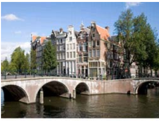
AMSTERDAM: There is no better way to see Amsterdam than by canal boat, cruising through the elegant grachten lined with stately homes dating back to Amsterdam's 'Golden Age.'