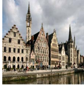
GHENT: Witness a unique city that has managed to preserve its medieval charm and power while keeping up with the times.

In a unique way, Ghent, the "diamond" of Flanders, has managed to preserve its medieval charm and power while keeping up with the times. A Local Guide will proudly point out that the city center alone is a showcase of medieval Flemish wealth and commercial success, and will take you into St. Baaf's Cathedral. From here we will have an excursion to the fascinating Bruges, with its criss-crossed canals and charming old patrician houses. (B, L, D)