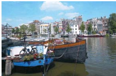
AMSTERDAM: Welcome to Amsterdam, Holland's delightful capital city with classic architecture, cafes, restaurants and lively marketplaces.